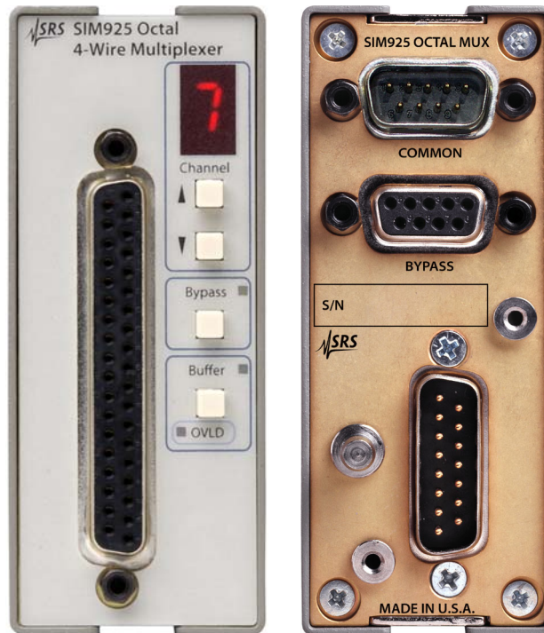
Figure 1.2: The SIM925 front and rear panels.