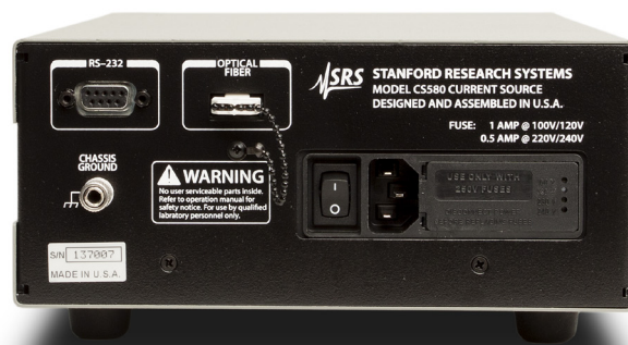
CS580 rear panel