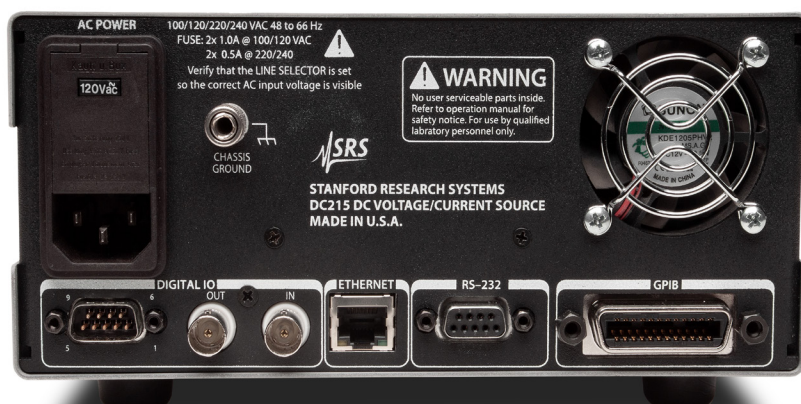
DC215 rear panel