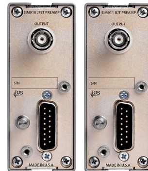
SIM910 & SIM911 rear panels